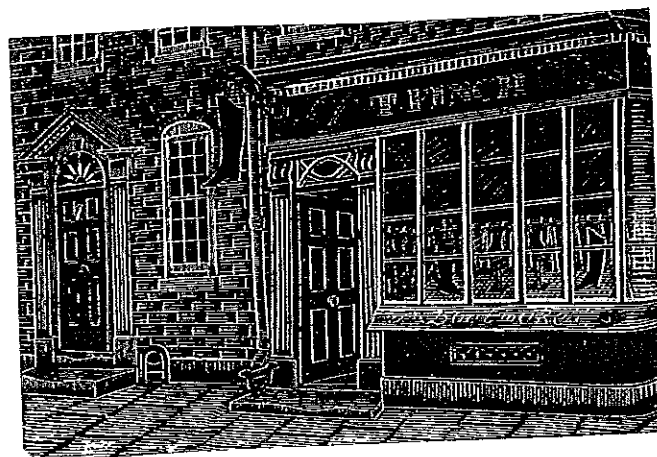
A couple more of the prints from 'Lark Rise to Candleford'